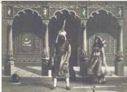
(right) Still from Thomas Edison's film 'The Hindoo Fakir,' 1902