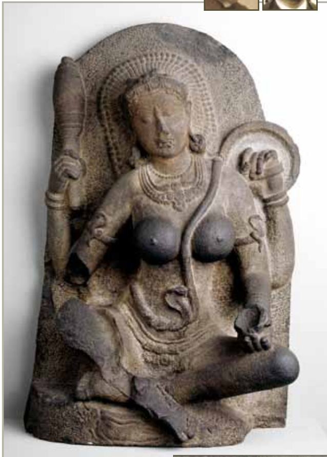
(above) Yogini, Unknown artist, Indian; 10th century; granite, Founders Society Purchase, Detroit Institute of Arts

Yoga: The Art of Transformation is the world's first exhibition about yoga's visual history. Masterpieces of sculpture and painting from the 3rd to the 18th century will be juxtaposed with modern photographs, books and films. Highlights include three monumental stone yogini goddesses from a 10th century Chola temple reunited for the first time, 10 folios (17th century) from the first illustrated compilation of asanas (yogic postures), and the first movie produced about India, Thomas Edison's Hindoo Fakir .