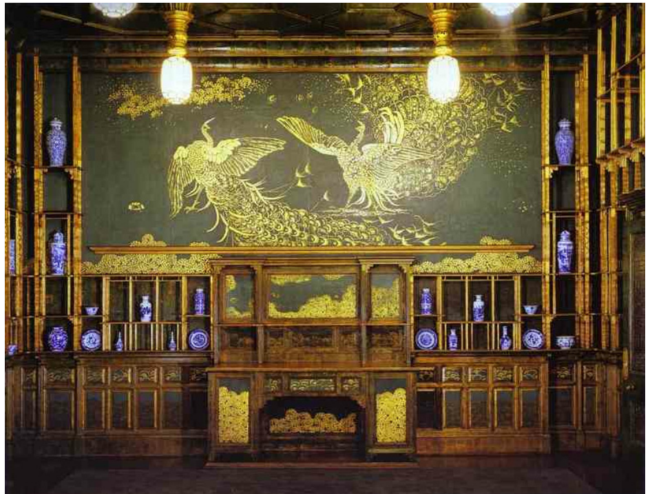
Detail of the South Wall, Harmony in Blue and Gold: The Peacock Room . By James McNeil Whistler (American, 1834-1903), 1876-77; Oil paint and metal leaf on leather, canvas, and wood; Freer Gallery, Washington