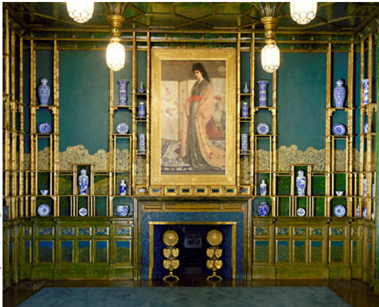
The Peacock Room by James McNeill Whistler (American, 1834-1903). 1876-1877. Freer Gallery of Art, Washington

Former Curator of American Art Freer Gallery of Art Smithsonian Institution