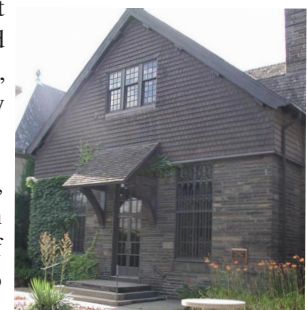
Peacock Room, Freer House

Charles Lang Freer, the Detroit industrialist who had built an incomparable collection of Whistler's work, purchased the room from a subsequent owner of the Leyland house and transported it to America. Despite Freer's efforts to subdue public attention, the Peacock Room attracted enormous publicity and countless art lovers made the pilgrimage to Detroit to see the room installed in his Ferry Avenue home. To downplay its glamorous (and scandalous) associations, Freer called Whistler's decoration simply the "Blue Room." After Freer's death in 1919, it was moved with his other treasures to the Freer Gallery of Art in Washington, D.C. which he had bequeathed to the nation.