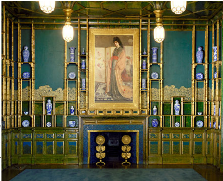
The Peacock Room by James McNeill Whistler (American, 1834-1903), 1876-1877. Freer Gallery of Art, Washington

Former Curator of American Art Freer Gallery of Art Smithsonian Institution