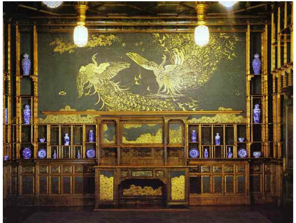
Detail of the South Wall, Harmony in Blue and Gold: The Peacock Room . By James McNeil Whistler (American, 1834-1903), 1876-77; Oil paint and metal leaf on leather, canvas, and wood; Freer Gallery, Washington