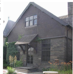
Peacock Room, Freer House

Charles Lang Freer, the Detroit industrialist who had built an incomparable collection of Whistler's work, purchased the room from a subsequent owner of the Leyland house and transported it to America. Despite Freer's efforts to subdue public attention, the Peacock Room attracted enormous publicity and countless art lovers made the pilgrimage to Detroit to see the room installed in his Ferry Avenue home. To downplay its glamorous (and scandalous) associations, Freer called Whistler's decoration simply the "Blue Room." After Freer's death in 1919, it was moved with his other treasures to the Freer Gallery of Art in Washington, D.C. which he had bequeathed to the nation.