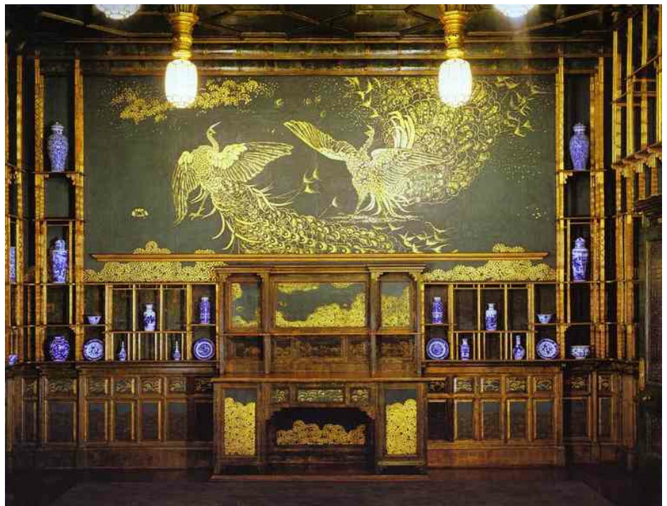
Detail of the South Wall, Harmony in Blue and Gold: The Peacock Room . By James McNeill Whistler (American, 1834-1903), 1876-77; Oil paint and metal leaf on leather, canvas, and wood; Freer Gallery, Washington