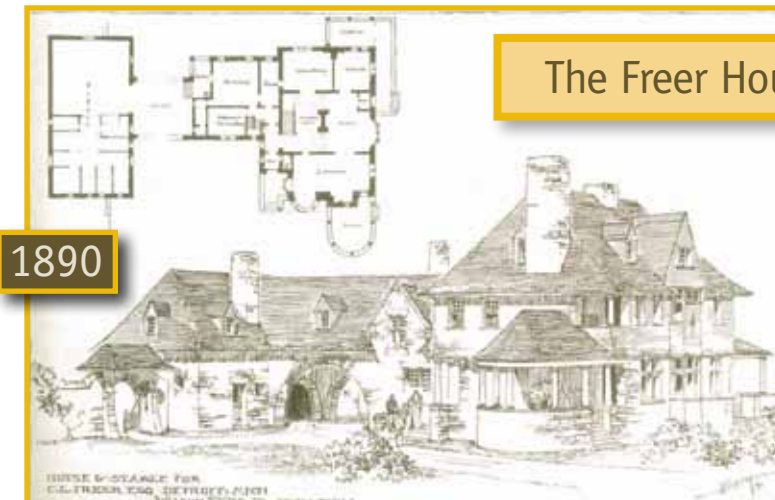
1890; House and Stable for C.L. Freer, Esq. Detroit, Mich. Rendering by Wilson Eyre. ( Detroit Institute of Arts Archives. ) 1906; Whistler Gallery in carriage house. ( Freer Gallery of Art Archives. )