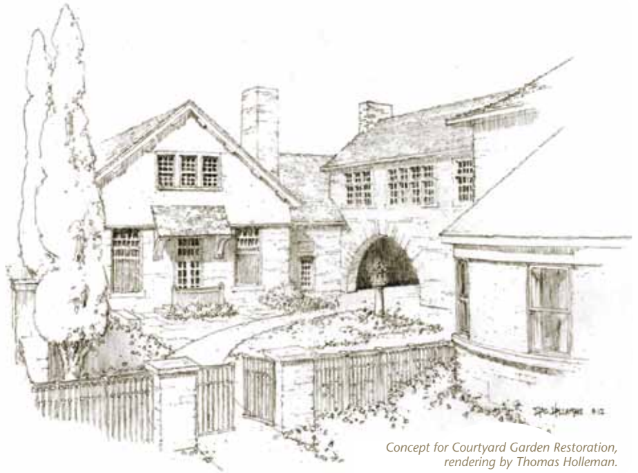
Concept for Courtyard Garden Restoration, rendering by Thomas Holleman.