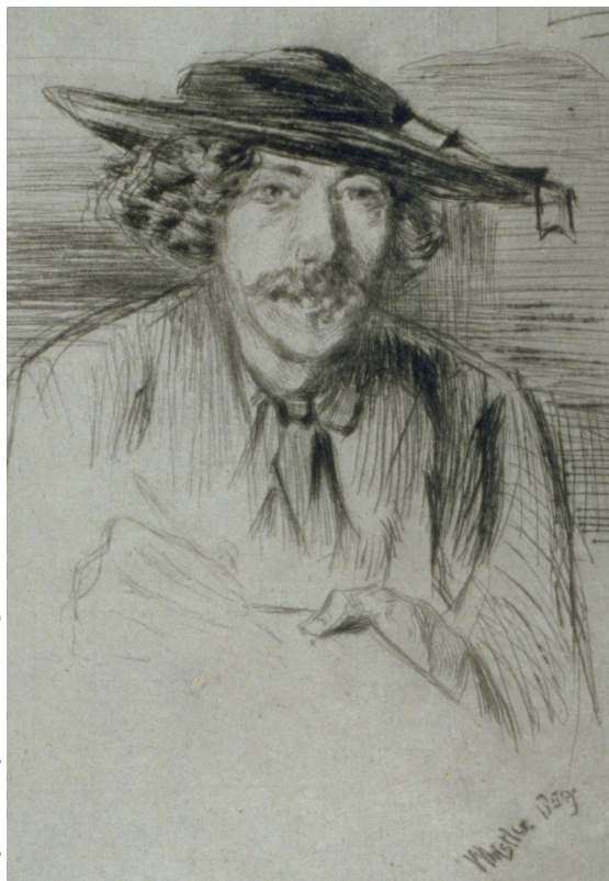
Self Portrait of Whistler, etching, James McNeill Whistler, 1859, University of Michigan Museum of Art