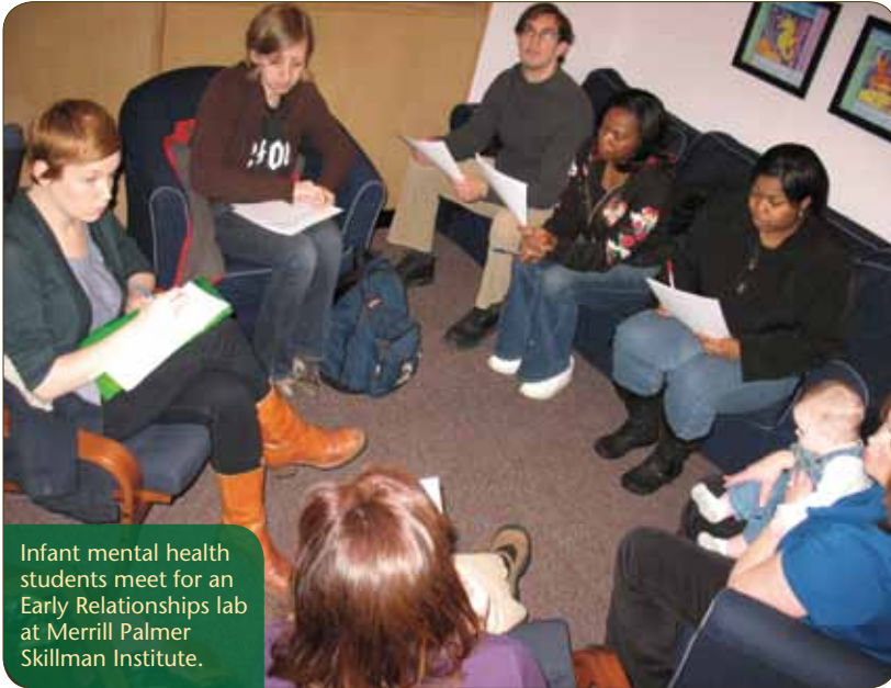
Infant mental health students meet for an Early Relationships lab at Merrill Palmer Skillman Institute.