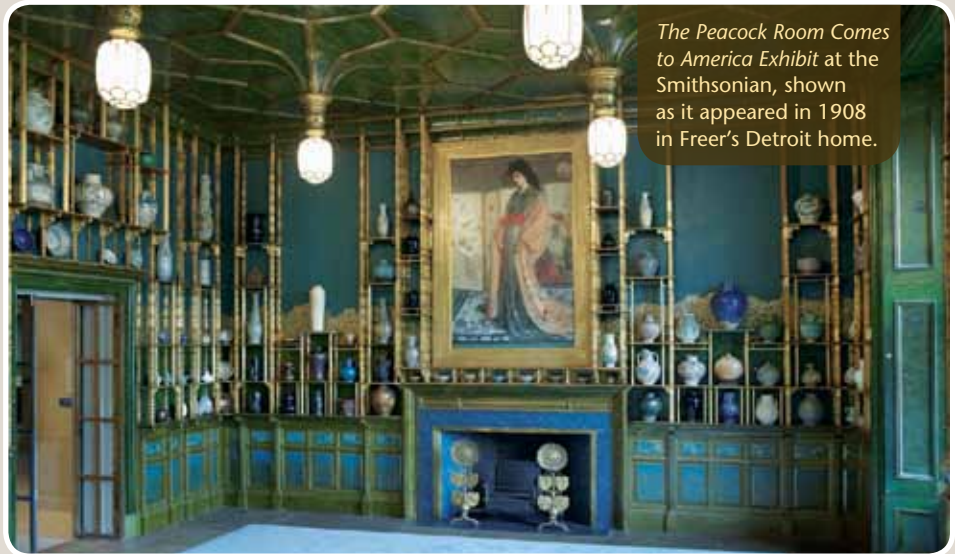
The Peacock Room Comes to America Exhibit at the Smithsonian, shown as it appeared in 1908 in Freer’s Detroit home.

The Peacock Room began as the dining room of a wealthy ship owner in London. American artist James McNeil Whistler decorated the room in an elaborate peacock motif. Charles Freer purchased the room in 1904 and moved it to his Detroit home. After his death in 1919, the Peacock Room was installed in the Freer Gallery of Art at the Smithsonian in Washington, D.C. In a new exhibit, The Peacock Room Comes to America , the Freer Gallery populated the Peacock Room with Freer’s ceramics arranged as he displayed them when the