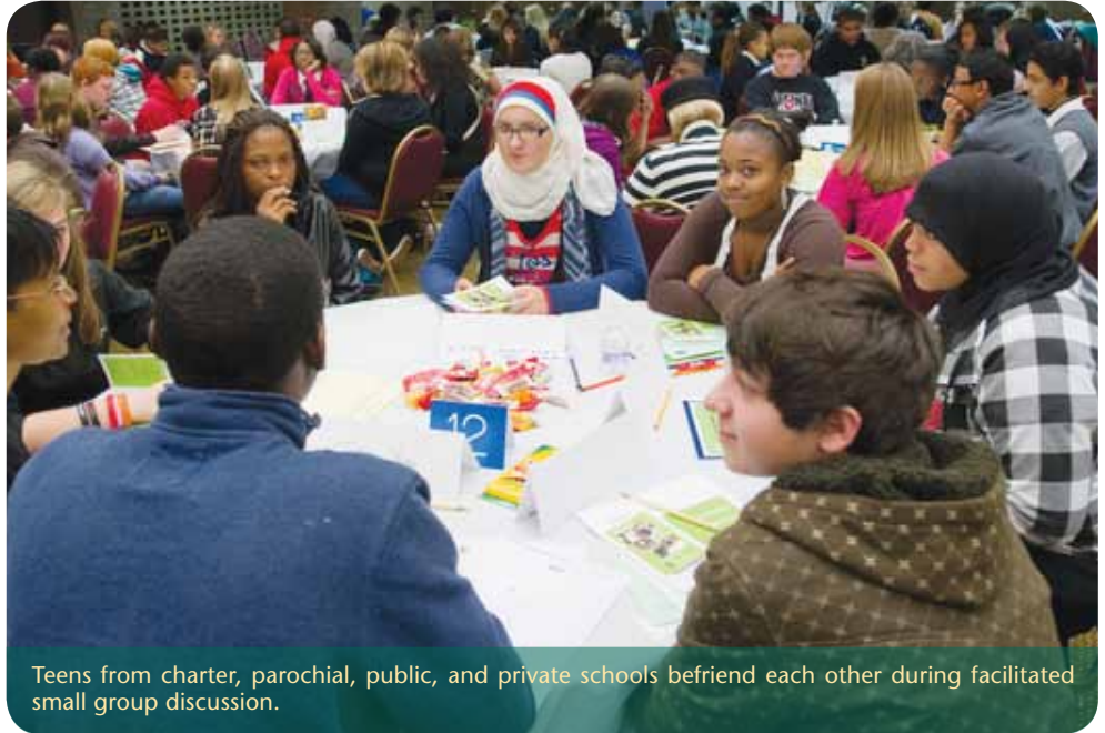
Teens from charter, parochial, public, and private schools befriend each other during facilitated small group discussion.

"I learned how others my age go through the same things I do."