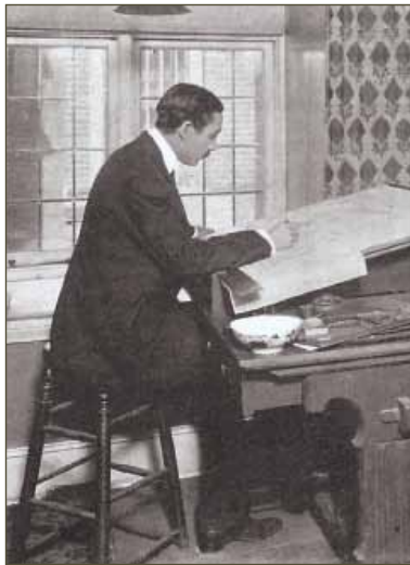
CLOCKWISE: Wilson Eyre, Jr., c.1900.

An International Landmark... A World Class Lecture Series