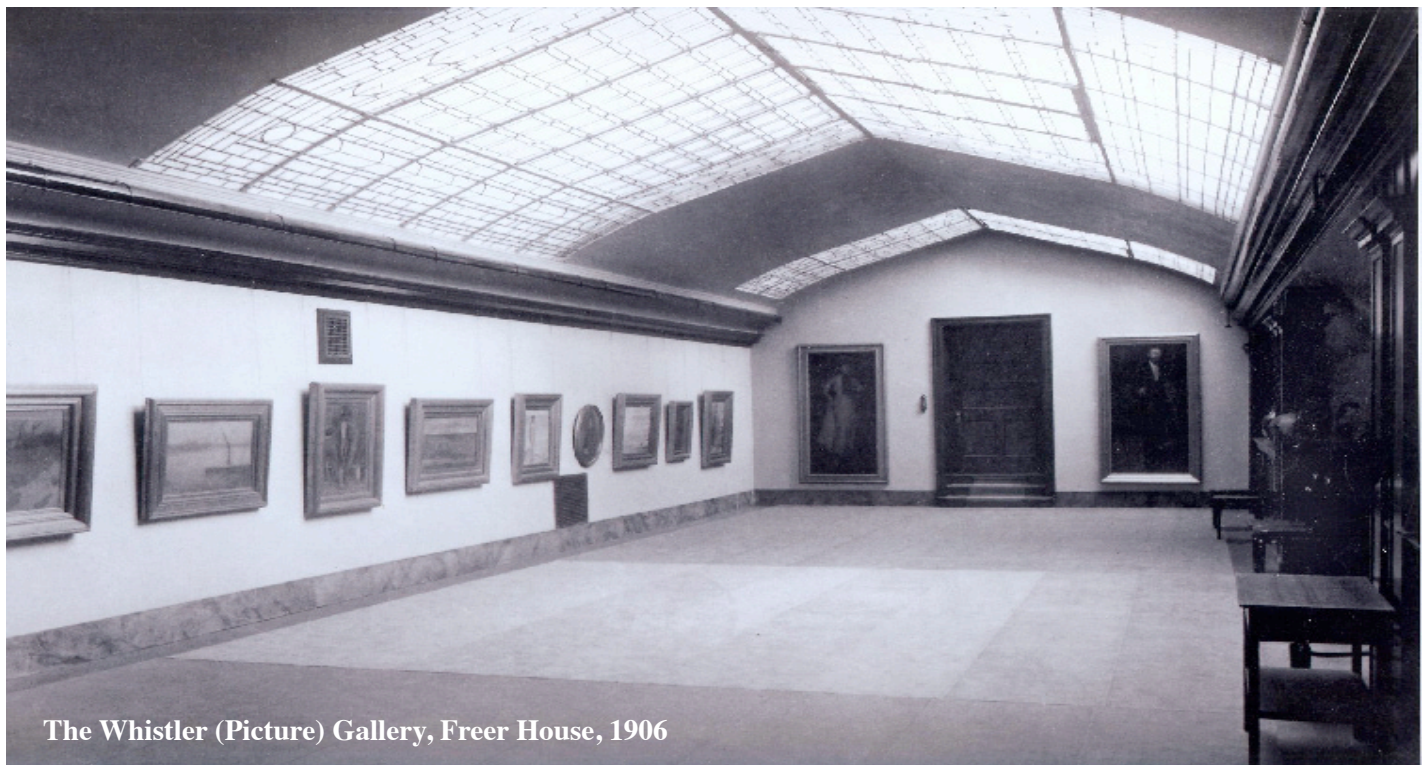
The Whistler (Picture) Gallery, Freer House, 1906