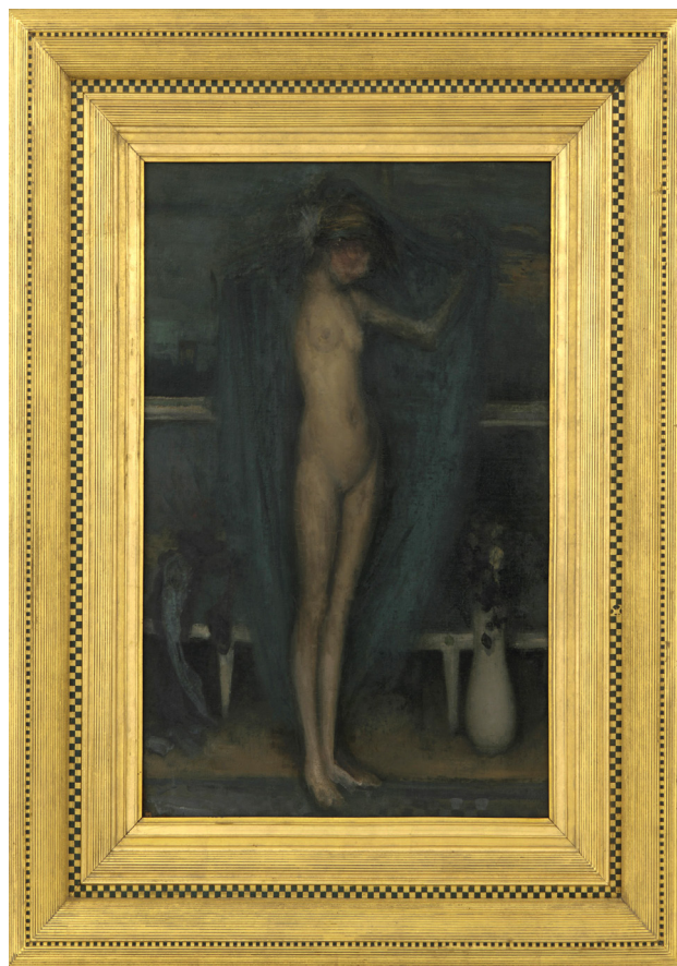
James McNeill Whistler, Harmony in Blue and Gold: The Little Blue Girl , 1894-1903, Freer Gallery of Art