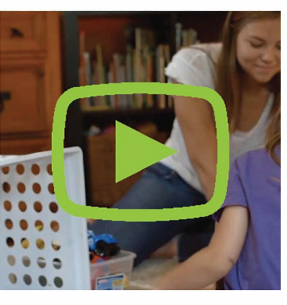
Special Play Time Part 1 VIEW (Youtube Video)