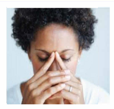
Self Care For Parents (Download PDF)