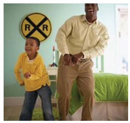
Indoor Family Fun (Download PDF)