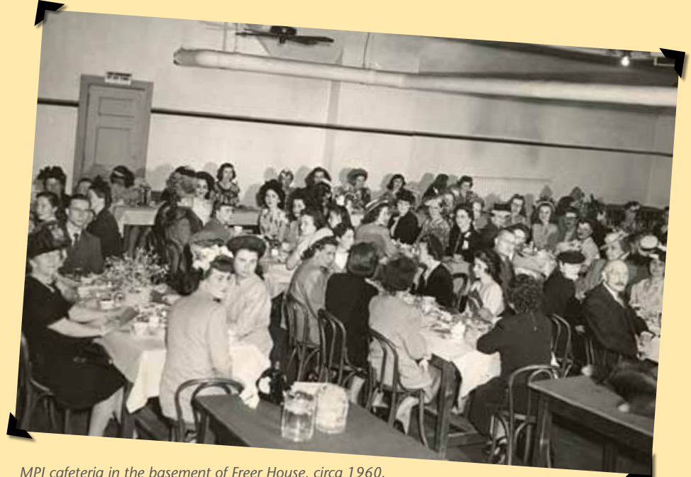
MPI cafeteria in the basement of Freer House, circa 1960.