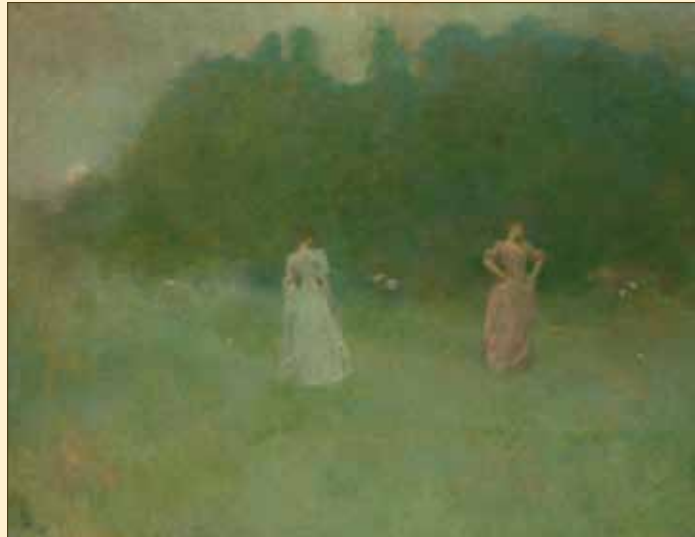
After Sunset, 1892 Thomas W. Dewing. Gift of Charles Lang Freer, Freer Gallery of Art, Smithsonian, F1906.68 a-b.