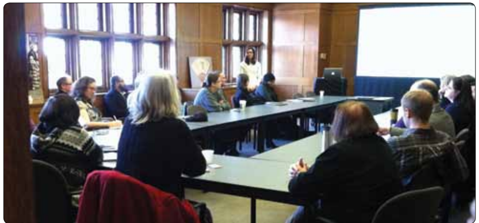
Bottom: In addition to posters, four MPSI trainees gave formal oral presentations on their work.

as foster parents and teachers in addition to biological parents.