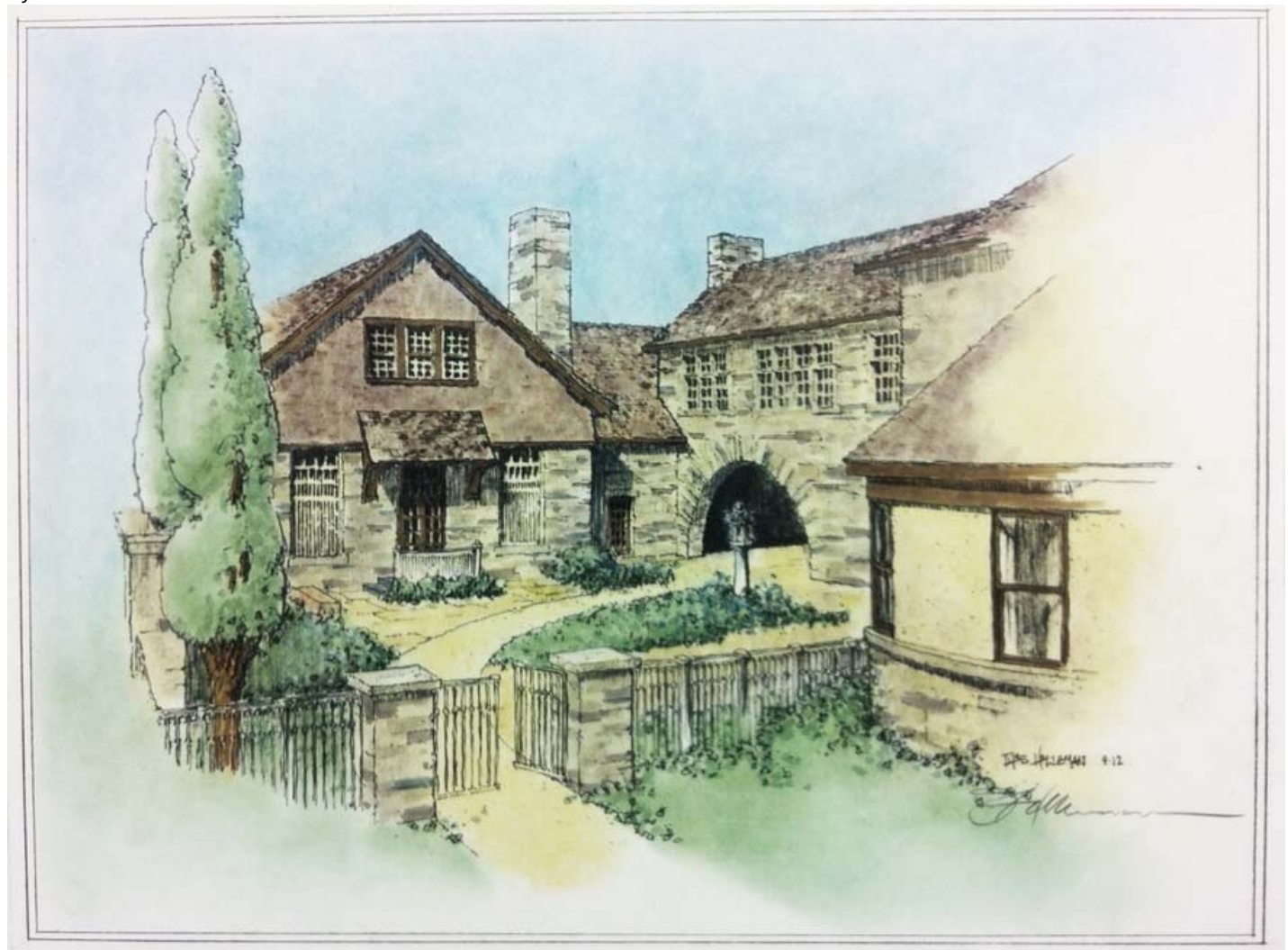
A rendering of the restored Freer House garden.

Charles Lang Freer loved Asian and American art so much that he had his 1892 shingle-style Detroit home expanded three times in 1906, 1910 and 1913 to accommodate his collection.