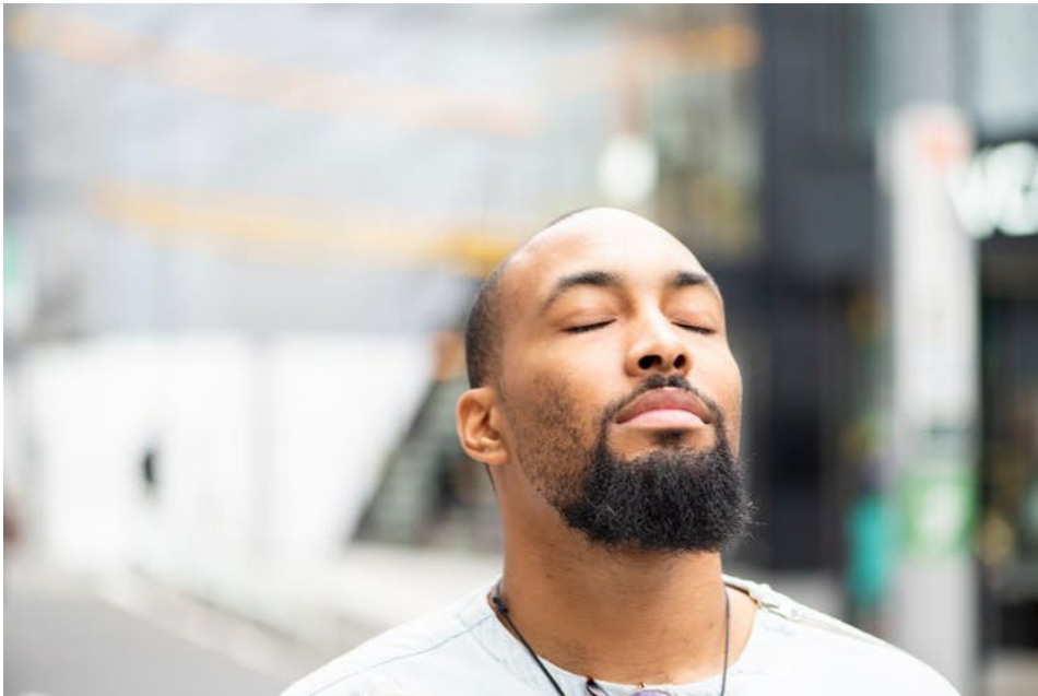
Meditation costs nothing and can be done almost anywhere.

I believe that mindfulness and meditation may be especially beneficial for children and teens because these skills may strengthen brain circuits that control the ability to focus and concentrate and to regulate emotions, which are maturing during this time. Establishing these habits early in life may also set the stage for good habits later in life.