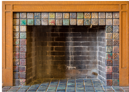
Pewabic tile fireplace (installed 1911)