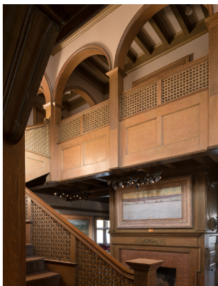
Main Hall (built 1892)

The Freer House was documented by renowned architectural photographer, Alex Vertikoff, in September, 2013. Here are a few of the 30 beautiful images now available to the Freer House for promotional purposes.