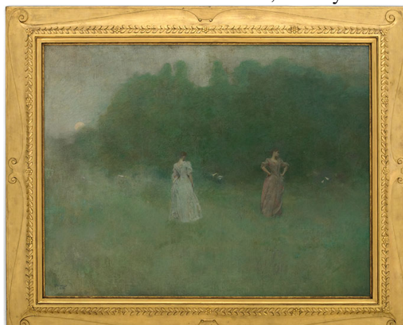
After Sunset , Thomas W. Dewing, 1892, oil on canvas. Gift of Charles Lang Freer, Freer Gallery of Art, Smithsonian, F1906.68.

as a middle-class pursuit at the turn of the century. A particular focus will be on the art and gardens of Maria Oakey and Thomas Wilmer Dewing, favorite artists and friends of Charles L. Freer, who contributed to the decoration of Freer's Detroit home and the design of his gardens, now scheduled for restoration as part of the Freer House Courtyard Revitalization Project.