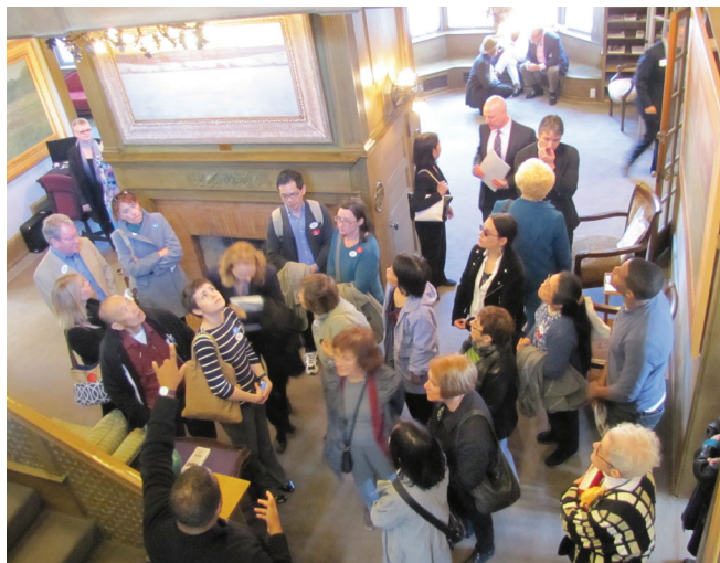
Freer House Tour, May 4th event reception