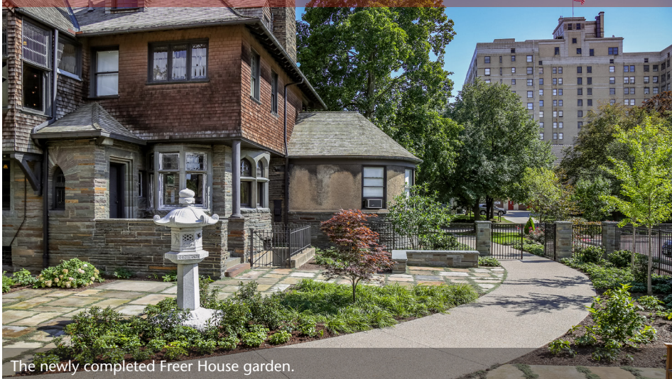
The newly completed Freer House garden.