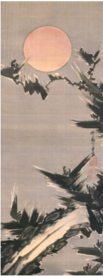
Jakuchū, Itō. New Year's Sun and Old Pine Tree . 1800, Minneapolis Institute of Art, Minneapolis. Shown in Edo Avant Garde .