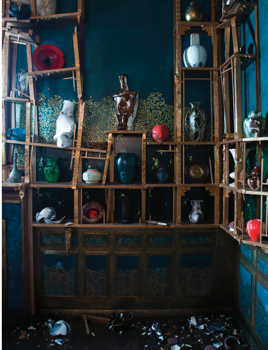
Damaged ceramics line the walls and floors of Filthy Lucre at MASS MoCA