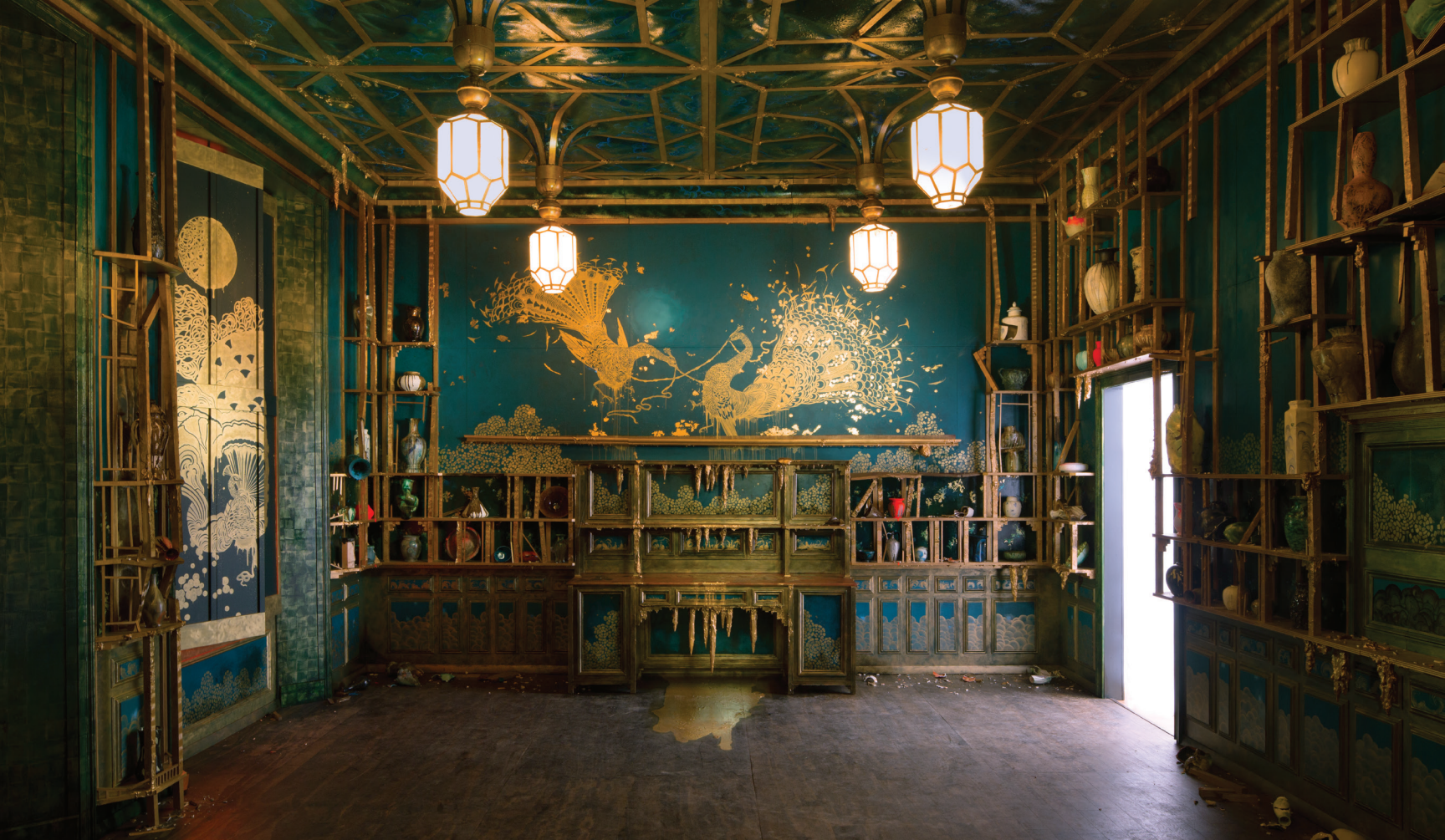
A view of Darren Waterston's Filthy Lucre looking toward the scene of fighting peacocks that he re-worked (as installed at MASS MoCA in 2014)