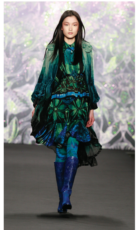
From Anna Sui's Fall 2008 collection, a tie-dyed peacock feather pattern burnout blouse and skirt, with painted ombre velvet coat