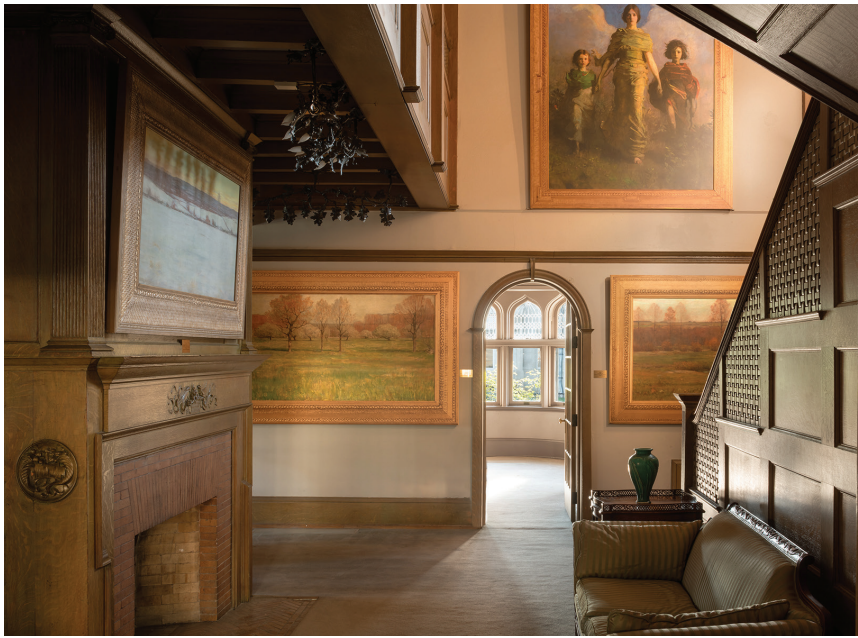
The Freer House's main hall and staircase feature framed reproductions of Tryon and Thayer paintings