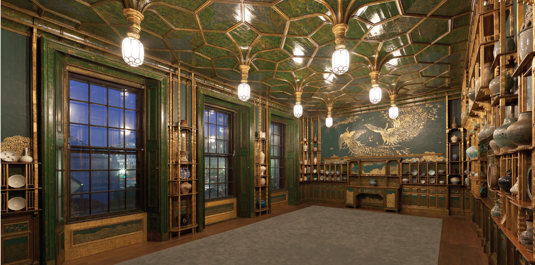
Harmony in Blue and Gold: The Peacock Room as it now appears on a wintry afternoon 1876-77, Oil paint and gold leaf on canvas, leather, and wood Freer Gallery of Art, Smithsonian Institution, Washington, D.C.; Gift of Charles Lang Freer, F1904.61

River valley, he was a hard-headed businessman who earned a fortune building railroad freight cars in Detroit, becoming rich enough to retire in 1900, aged just 47. In 1883, this lifelong bachelor had begun teaching himself about art, and he grew interested in Whistler three years later. (They met for the first time in 1890.) Guided by Whistler and various dealers, artists, and scholars in a successful quest to develop his own “eye,” knowledge, and instincts, Freer ultimately assembled outstanding collections of Asian and American art, and also bought in other areas such as Early Christian manuscripts. With Whistler’s encouragement, he sought out great artworks abroad, visiting Asia four times before 1911, when failing health forced him to spend more time in New York City near his doctors.