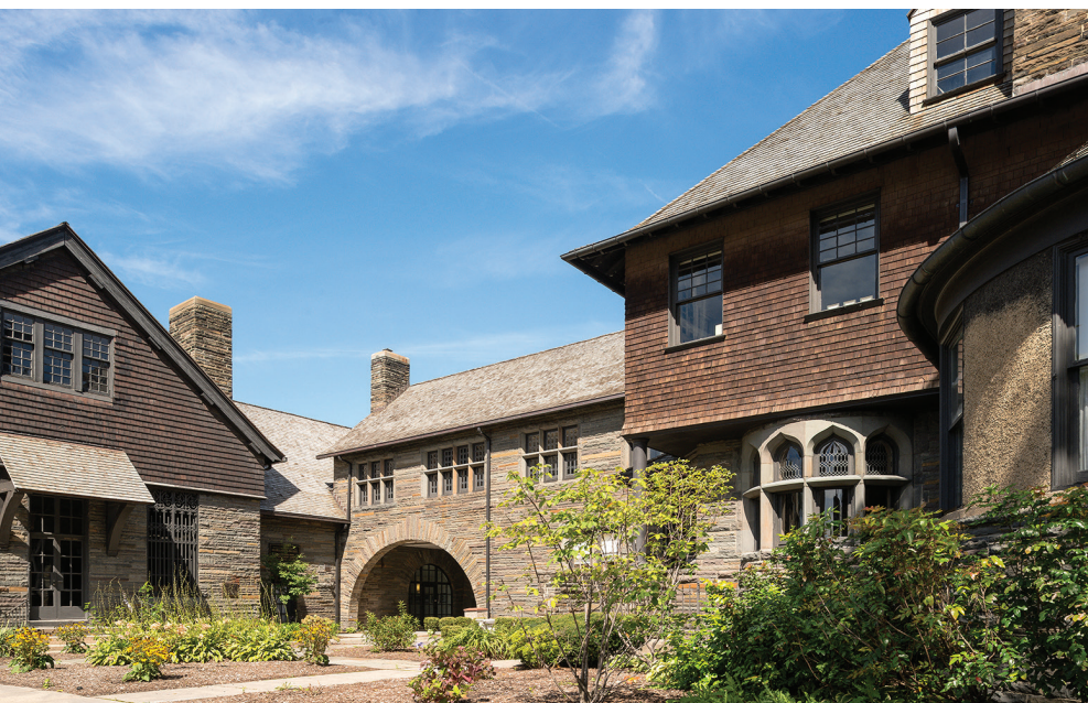
The Freer House seen from its back garden