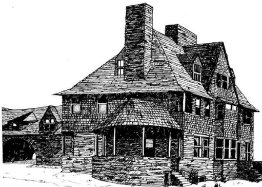
Sketch of the Charles Lang Freer House, Circa 1900