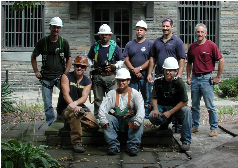
Construction Crew ---Back Row-Left to Right.