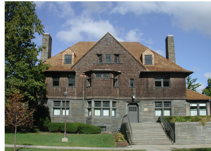
The Merrill Palmer Skillman Institute