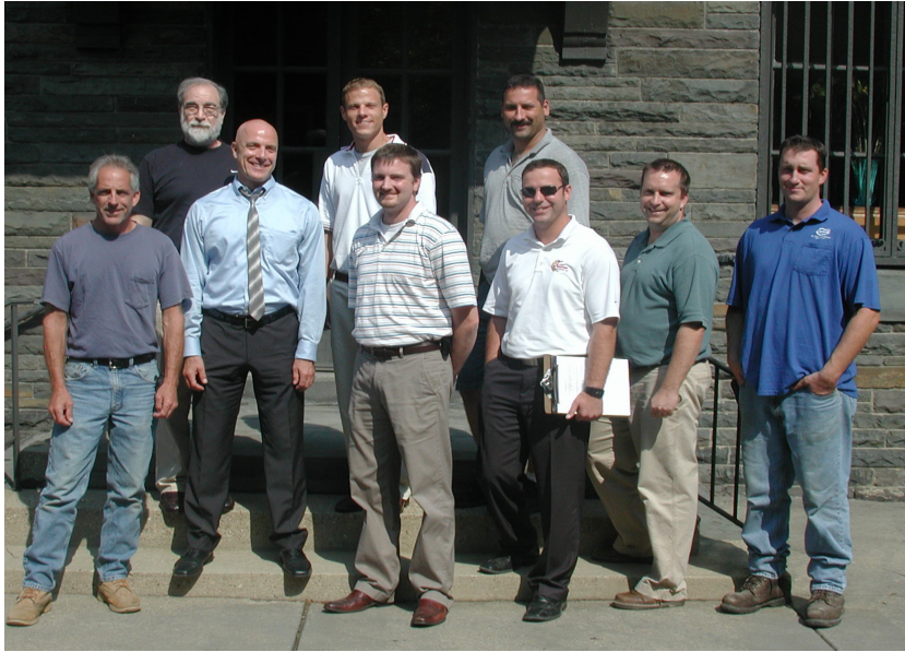
Management Team-----Back Row-Left to Right.