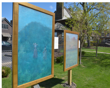
Summer and Autumn reproductions

The outstanding partnership between the DIA and The Freer House has grown to include joint programs and projects with departments ranging from American Art to Conservation. A highlight of 2015 was a collaborative effort with the Community Relations Department's Inside/Out program to replicate the DIA's triptych painting Spring, Summer, Autumn by artists Dewing and Tryon, commissioned by Hecker for his home in 1894 under Freer's influence. The reproductions were installed on Ferry Street between the Hecker and Freer Houses from April-July, 2015.