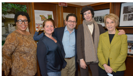
Friends of the Freer House from the DIA

The Freer House has continued to welcome and receive individuals and groups asking to tour the building at regular and specially scheduled tours. Groups visiting in recent months include the Japan Business Society of Detroit, the Junior League of Detroit, the American Association of University Women, Kresge Arts Fellows, DIA members and staff, as well as students and classes from CCS, WSU and U of M.