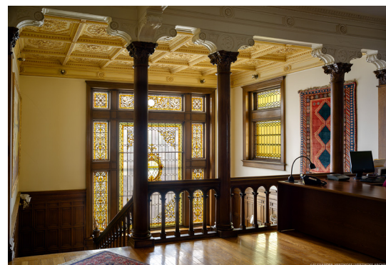
Staircase Landing, Hecker House