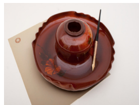
Freer's Rookwood Inkwell