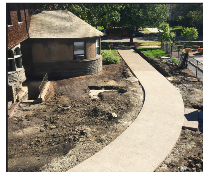
Garden Project, Phase I

Two major projects to restore the Freer House have begun. The Garden Revitalization Project, Phase I, include clearance, grading and paving of new walkways. As funds are secured in 2016, work will continue with implementation of the historic garden plan including appropriate plantings, fencing and seating. Also, the replacement of all outdated heating and cooling systems in the Freer House has been approved by the WSU Board of Governors and work on this project has begun. As part of this project, an inappropriate HVAC unit installed in the historic Whistler Gallery in the 1960's will be removed, allowing the restoration plan for this important room to move forward as funding is secured.