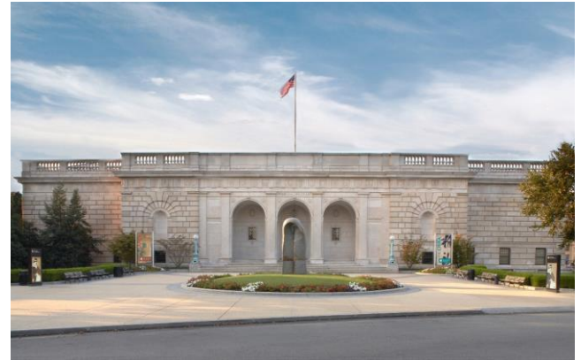
Freer Gallery of Art, Smithsonian