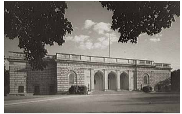
(l to r) Charles L. Freer, photo by E. Steichen, 1915; The Freer House, Detroit, 1904 (Photos courtesy, Freer Gallery of Art Archives); The Freer Gallery of Art, 1950 (Courtesy the Library of Congress)