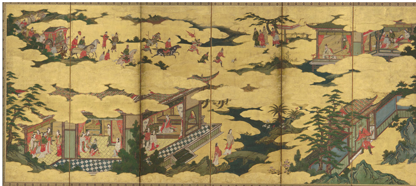
Scenes from the life of the Emperor Ming Huang and his favorite concubine, Yang Kuei-fei (partial view) Kano Mitsunobu, (Japanese, ca. 1565-1608) Momoyama period. Freer Gallery of Art, Smithsonian Institution, F1901.20-21. Gift of Charles Lang Freer.

An International Landmark... A World Class Lecture Series