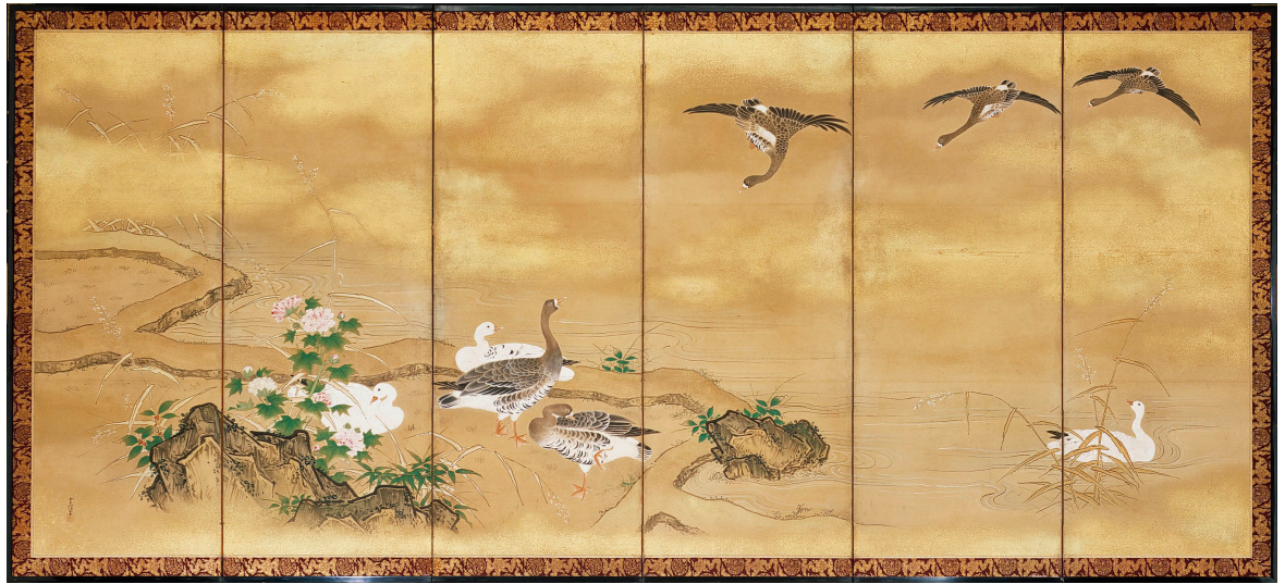
Reeds and Geese , Kano Tsunenobu (1636-1713), Edo, 17th Century. One of a pair of six-panel folding screens. Detroit Institute of Arts, Founders Society Purchase, Acquisition Fund, 80.43.1 -2.