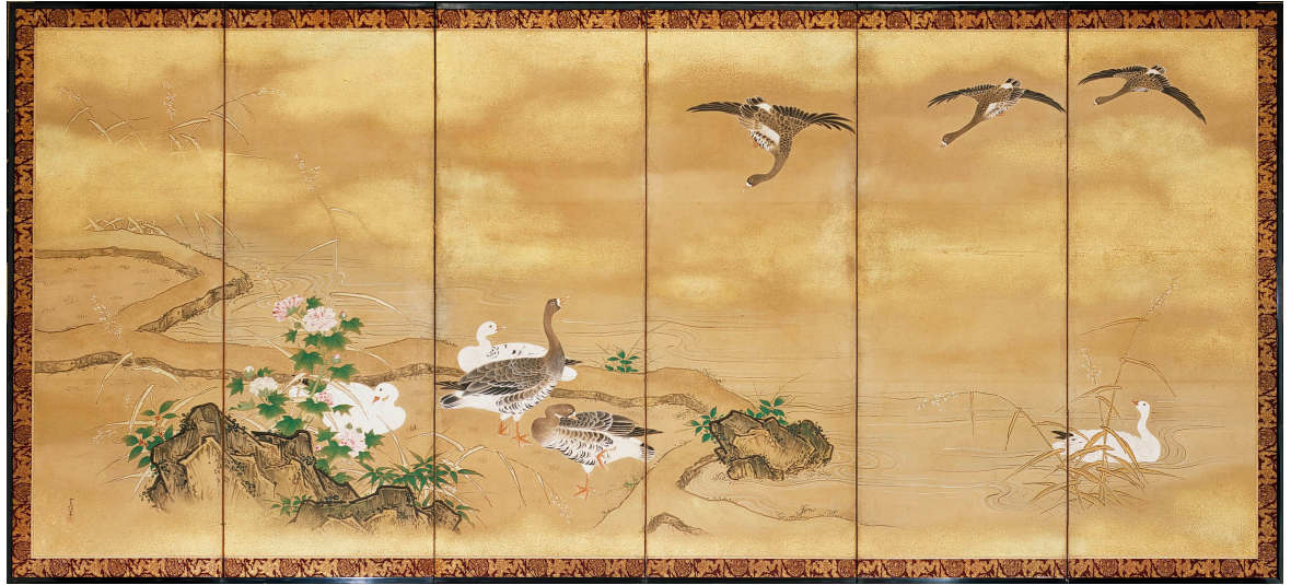
Reeds and Geese , Kano Tsunenobu (1636-1713), Edo, 17th Century. One of a pair of six-panel folding screens. Detroit Institute of Arts, Founders Society Purchase, Acquisition Fund, 80.43.1 -2.