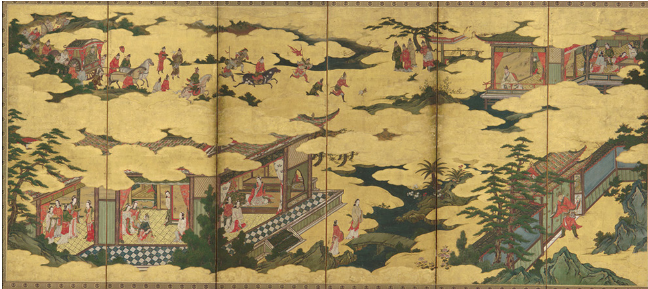
Scenes from the life of the Emperor Ming Huang and his favorite concubine, Yang Kuei-fei (partial view) Kano Mitsunobu, (Japanese, ca. 1565-1608) Momoyama period. Freer Gallery of Art, Smithsonian Institution, F1901.20-21. Gift of Charles Lang Freer.

An International Landmark... A World Class Lecture Series