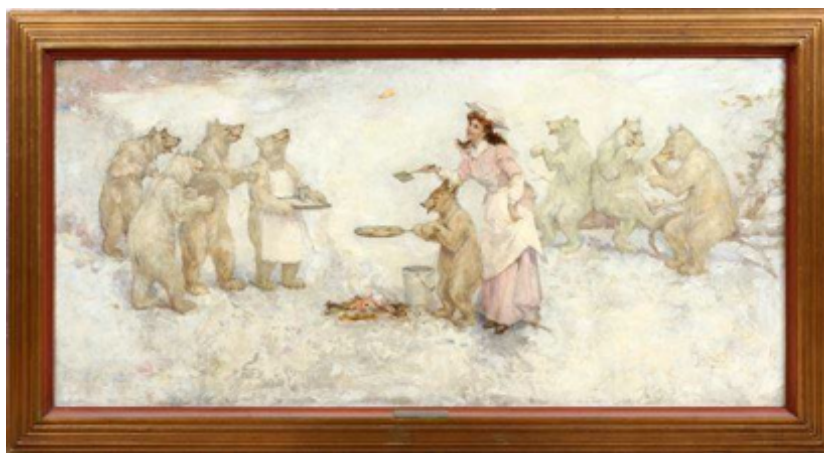
Flapjacks by Fredrick Stuart Church, 1892