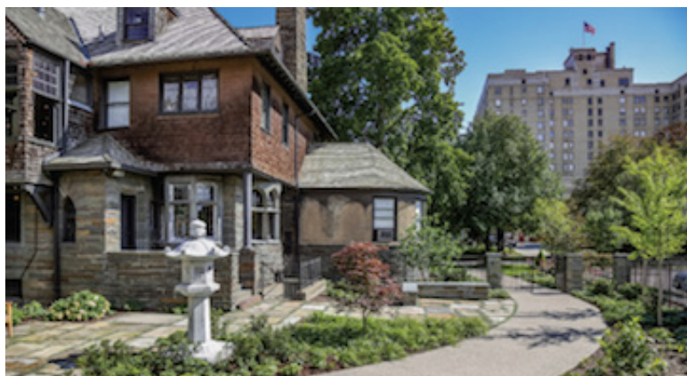
The newly completed Freer House garden