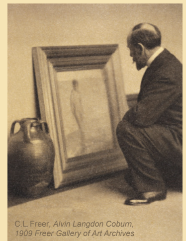
C.L. Freer

(1854-1919) made his fortune in railroad freight car manufacturing in Detroit. His remarkable shingle style residence on East Ferry Ave. was designed in 1892 by Wilson Eyre, Jr. Freer's home contained one of the world's greatest collections of Asian and American art, including works by Whistler and the Peacock Room. Freer bequeathed his collection to the Smithsonian where it is housed today at the Freer Gallery of Art in Washington, D.C.