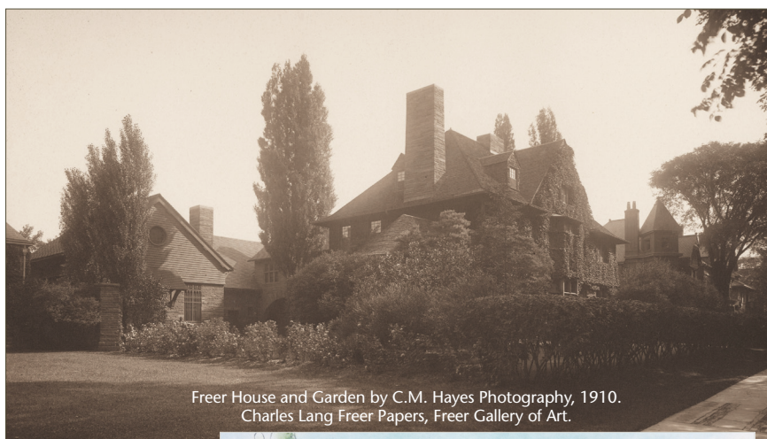
Freer House and Garden. Charles Lang Freer Papers, Freer Gallery of Art.