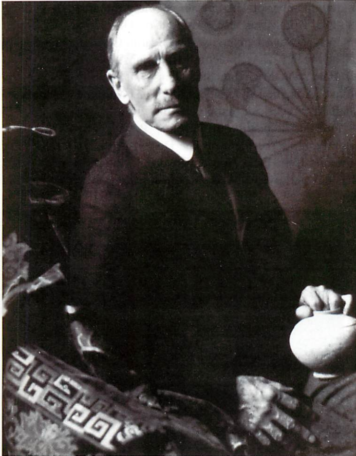
Charles Lang Freer, ca. 1915-16.