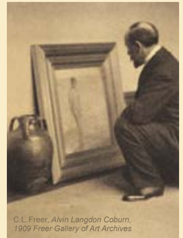
C.L. Freer

(1854-1919) made his fortune in railroad freight car manufacturing in Detroit. His remarkable shingle style residence on East Ferry Ave. was designed in 1892 by Wilson Eyre, Jr. Freer's home contained one of the world's greatest collections of Asian and American art, including works by Whistler and the Peacock Room. Freer bequeathed his collection to the Smithsonian where it is housed today at the Freer Gallery of Art in Washington, D.C.