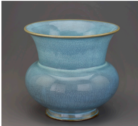
Flowerpot with impressed number yi (one), China, Henan Province, Yuxian, Juntai, Ming, dynasty, early 15th century Stoneware with Jun glaze, Gift of Charles Lang Freer. F1907.38