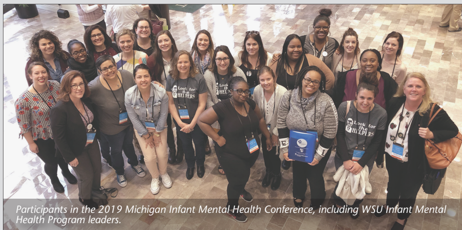
Participants in the 2019 Michigan Infant Mental Health Conference, including WSU Infant Mental Health Program leaders.