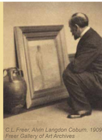
C.L. Freer