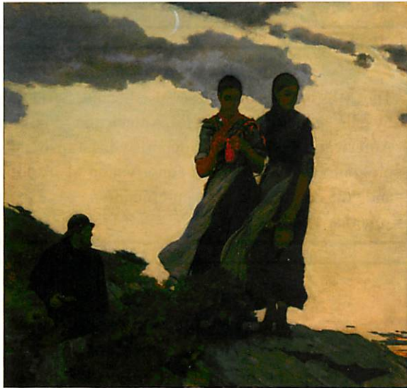
Early Evening, Winslow Homer 1881/1907, Freer Gallery of Art, Smithsonian Institution.