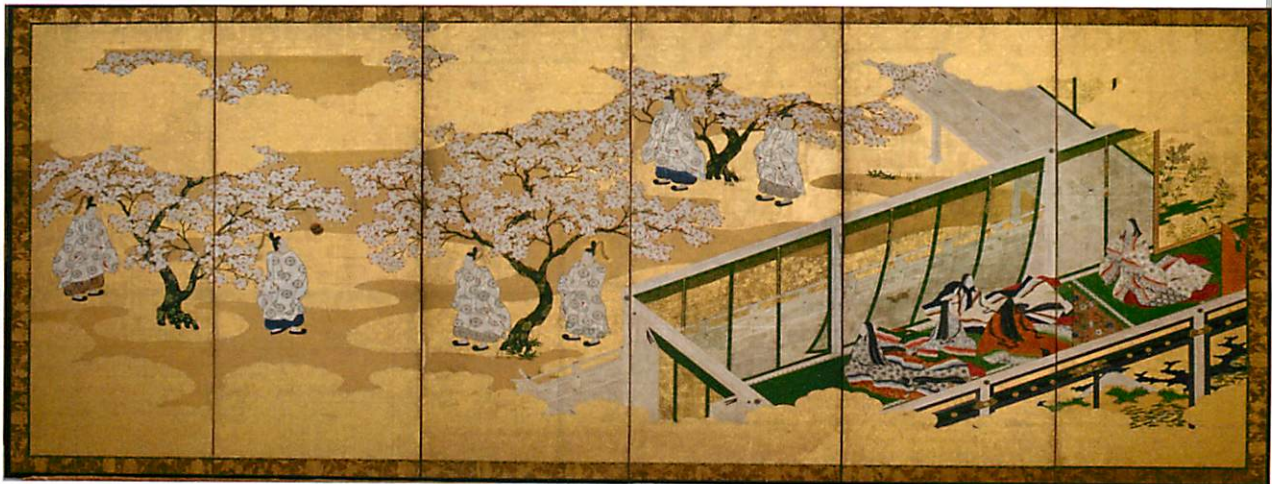
Scene from 'The Tale of Genji,' 'The Broom Tree,' Tosa Mitsunoki, (Japanese, 1617-1691) Freer Gallery of Art, Smithsonian Institution.

University of Michigan Museum of Art University of Michigan Museum Studies Program